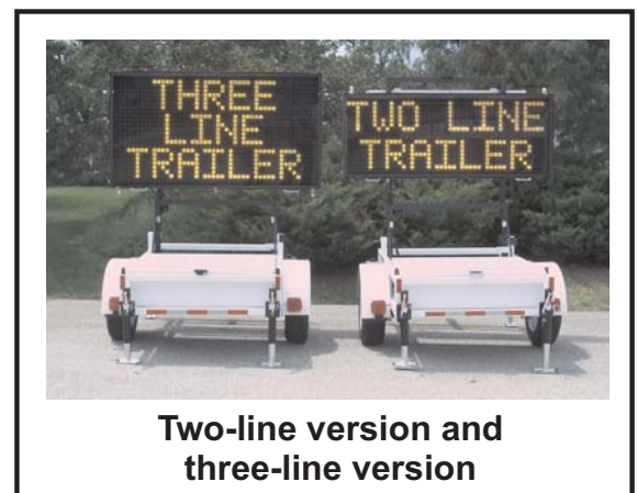
Two-line version and three-line version

The company: MPH Industries, Inc. specializes in velocity measurement. Formed in 1975, MPH is one of the largest suppliers of radar equipment to law enforcement worldwide. MPH also manufactures a full line of in-car video equipment and serves the highway and rail transportation industries. MPH Industries is a subsidiary of MPD, Inc., an manufacturer of aerospace components and subsystems, electronic components, and breath alcohol systems.